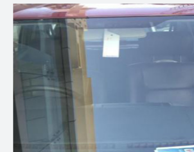
Illustration: Manual RFID card (to be hung on rear view mirror)