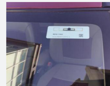
Illustration: Factory fitted RFID tags (given at co-driver side on front windshield)